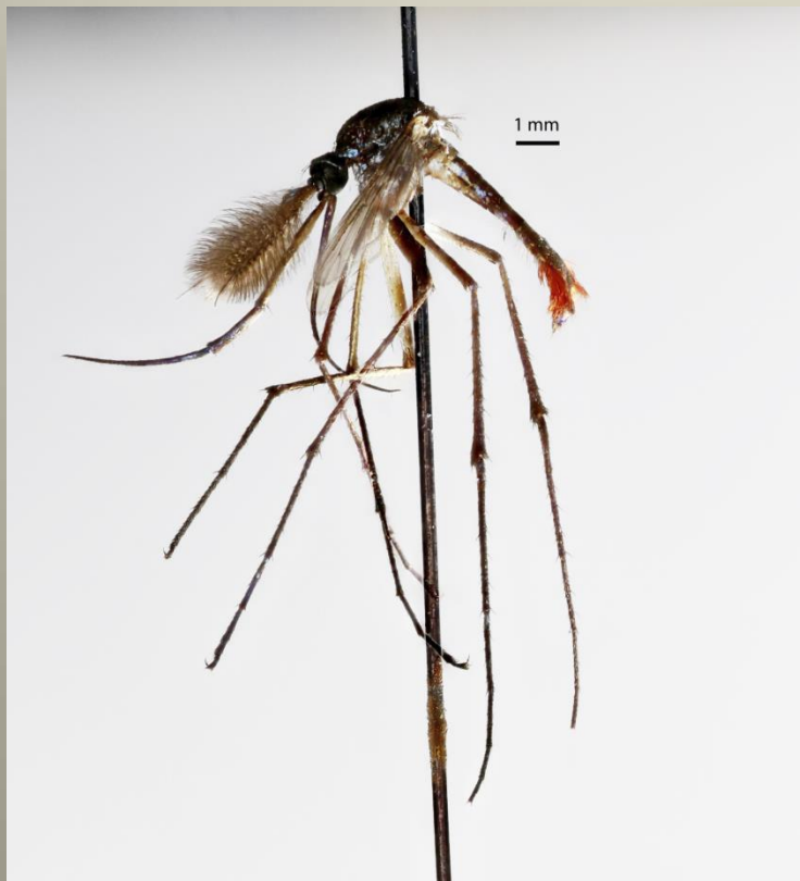
Figure 1. A Toxorhynchites mosquito. They are beneficial mosquitoes because they do not bite, and they eat other mosquitoes as larvae.

The State of Ohio has about 60 species of mosquitoes , but not all species live in Darke County. Also, most species are not able to spread diseases , and instead are more of a nuisance.